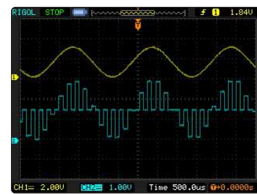
Flat Top Sampled Output