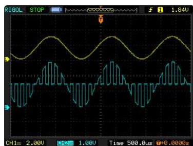
Natural Sampled Output